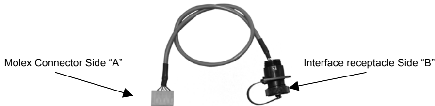
DCI-1 cable Part Number: 01381